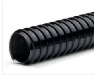
SERIE 3 PUR SN

Version with up to 40 bar working pressure/120 bar bursting pressure