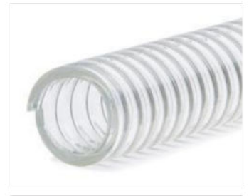
FLEXACIER® LT PU